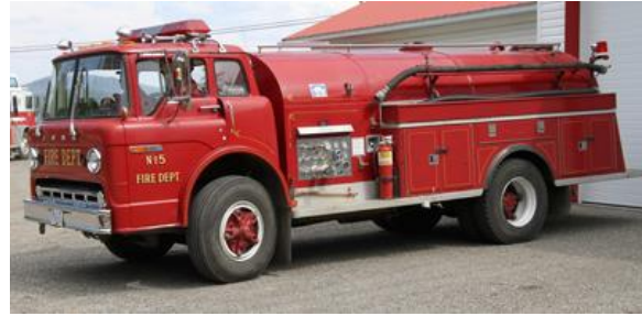
Goodbye old faithful.

Our Pumpers are in excellent condition, however, in about three years they will have reached their maximum acceptable age for rating by the Underwriters. Engine 21 is in excellent condition and will pass the necessary testing to keep it in the fleet as a backup vehicle for many years. We have enough funding from the compensation for the department's wildfire services to begin saving for a replacement for Engine 11, Hopefully, when the time comes, we will have enough money set aside to allow us to purchase a newer vehicle that will give us service for at least ten years.