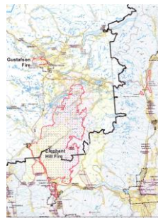
28 cm x 40 cm Elephant Hill Wildfire Map