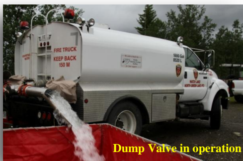
Dump Valve in operation

If it were not for the BC Lotteries Grant, a $5,000 grant from the CRD and a lot of pie sales by the Auxiliary we would never have been able to afford this vehicle. It gets from water source to fire and back quickly and once at a fire it can be connected directly to Engine 11 or 21 or it can dump its load of water into one of the portable ponds.