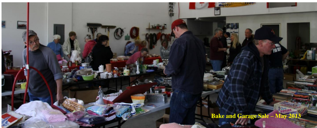
Bake and Garage Sale – May 2013

Saturday morning was beautiful and the bargain hunters were at the door early. They were very pleased at the selection of items available to them including a variety of home baked goods.