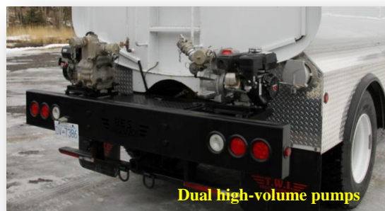
Dual high-volume pumps

The newest tender, T21, has proven to be a tremendous asset to the fleet. This truck was outfitted in California for fighting brush fires and came with 2 high-volume pumps mounted on the rear bumper. With these pumps the tank can be rapidly filled or hoses can be attached for fire fighting.