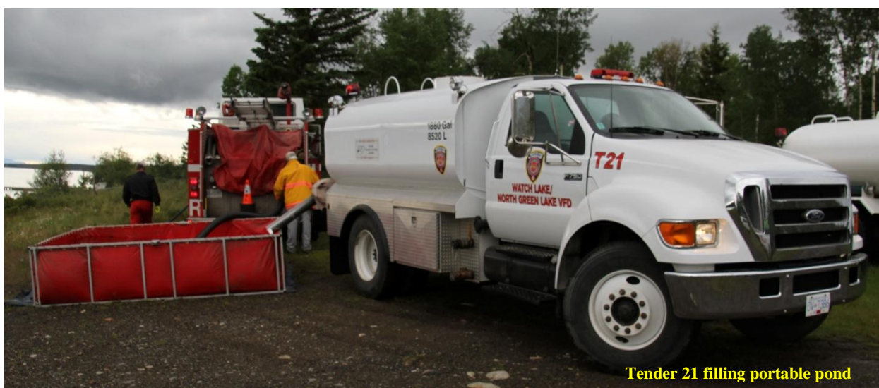
Tender 21 filling portable pond

The newest tender, T21, has proven to be a tremendous asset to the fleet. This truck was outfitted in California for fighting brush fires and came with 2 high-volume pumps mounted on the rear bumper. With these pumps the tank can be rapidly filled or hoses can be attached for fire fighting.