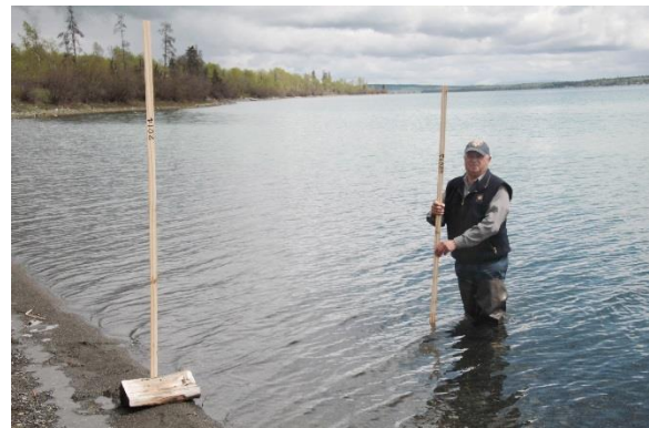
Difference in water level 2013 to 2014

Heavy rain in the late spring combined with a moderate winter snow pack and a slow melt has provided a good run-off and the lake is currently higher than it has been for several years. This is good news since we always worry about reasonably accessible sources of water to fill the tenders for training and firefighting. The slow start to spring also delayed the regional fire ban that was imposed last year on April 1 st . This year we have not, as yet, had a total ban, but fire restrictions did come into effect on May 15 th . (see website for restriction details)