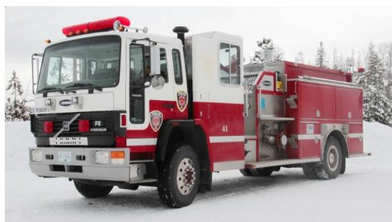
Engine 11 – 1993 Volvo Pumper

we received a response from the Oyster River Fire Department in the Comox Valley Regional District. They had exactly what we were looking for!